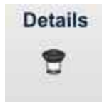
Size 0 (Tauro® 25)

To mount taps in quick change tapping chucks. The selection of the taps results out of shank diameter and square