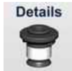
Size 2 (Taurox® 400 / 900)