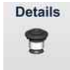
Size 1 (Tauro® 83 / 120 / Taurox® 300)